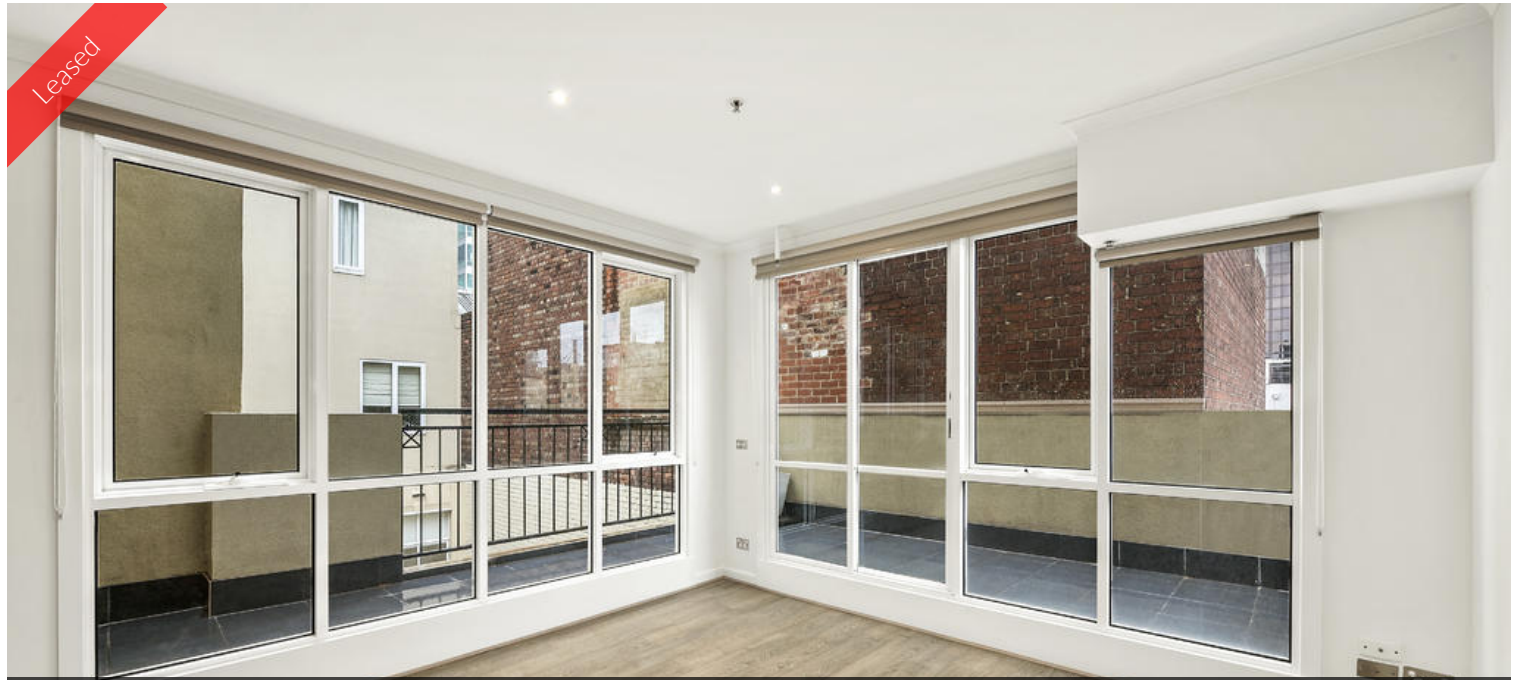
Unit 1115, 422-428 Collins St, Melbourne