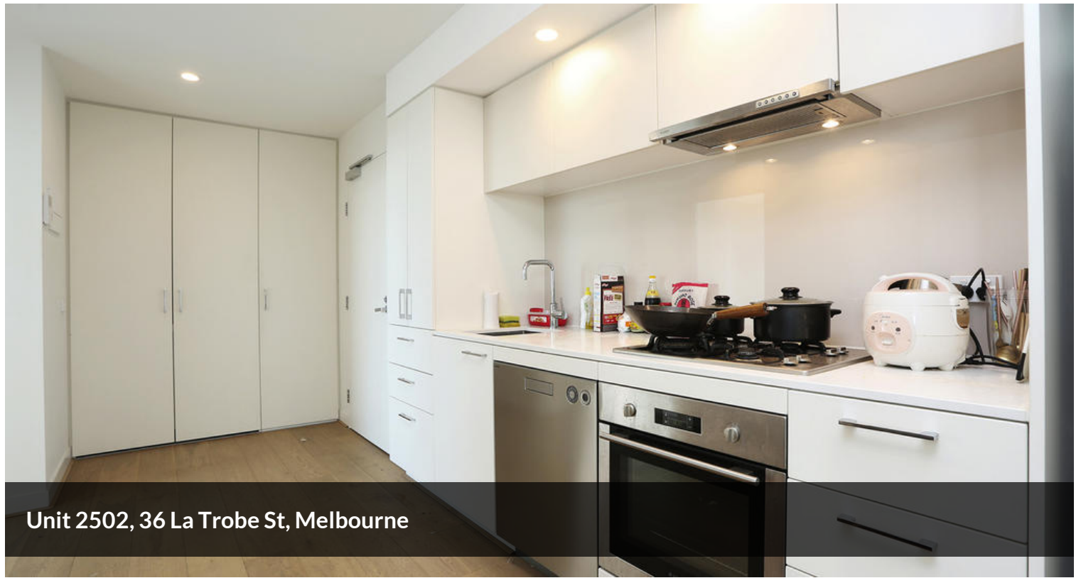
Unit 2502, 36 La Trobe St, Melbourne